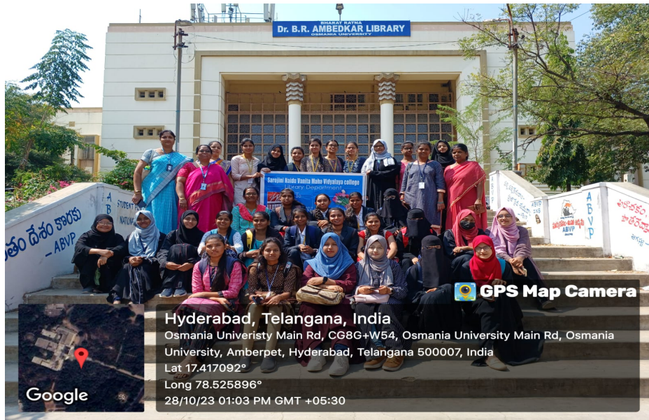
Bharat Ratna Dr. B.R. Ambedkar Memorial Library, O.U.