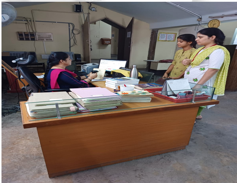
Issues and returns