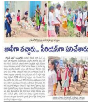
Special Rural Camp