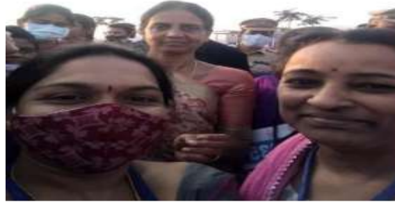
NSS volunteers Participated in 2k&5k run