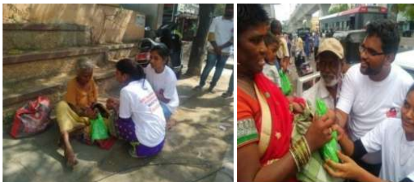
NSS Volunteers participated in distribution of Food Packets and Butter milk