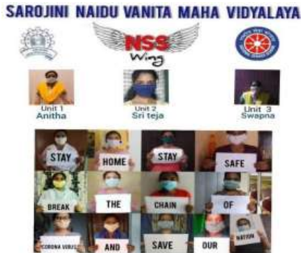
COVID-19 Awareness Programme