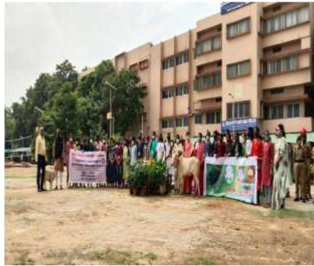
Prkruthi Vandana Program by IMCTF