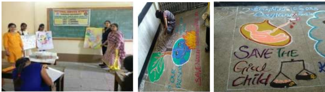
NSS Day Competitions