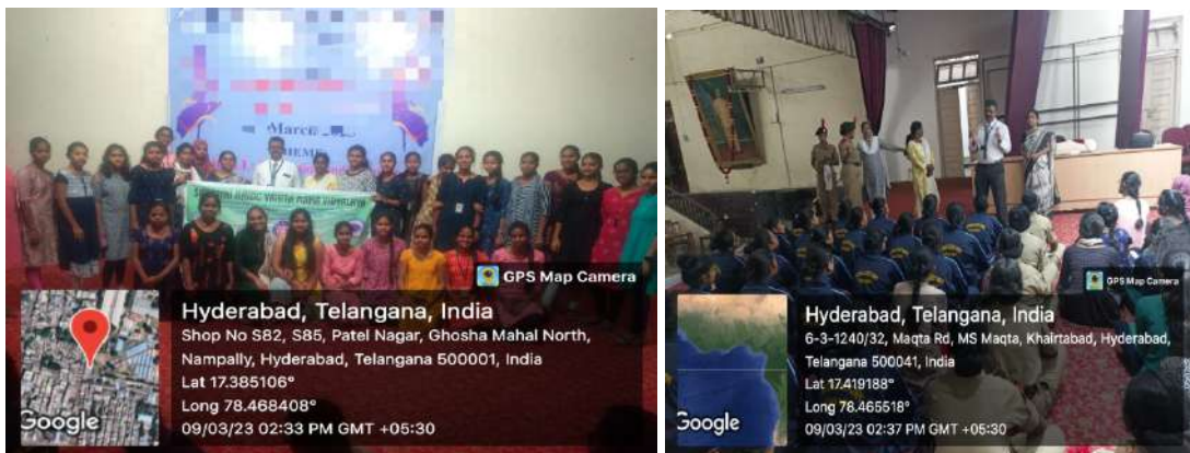
CPR training conducted with St.John Ambulance Association

09-03-23: CPR training conducted collaboration with St.John Ambulance Association .