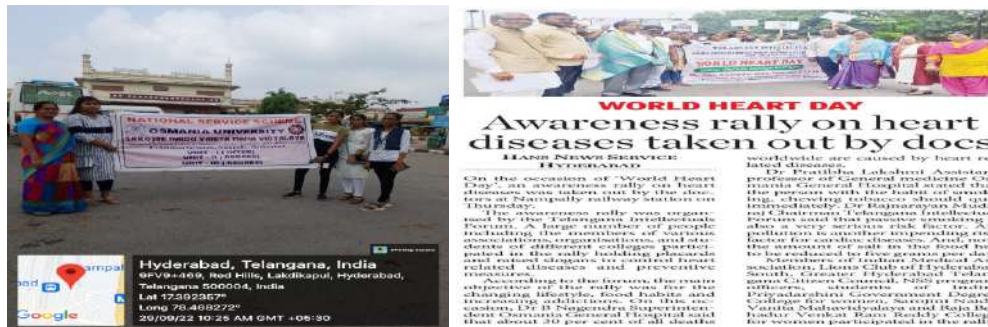
NSS Volunteers participated in World Heart day Rally