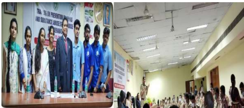
Training program on Prevention of drugs & substance Abuse/ Sexual Abuse