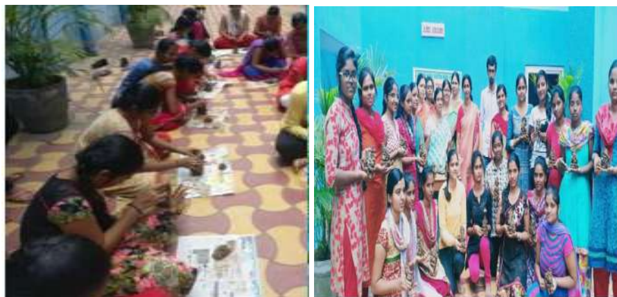
Ecofriendly Clay Ganesh Workshop