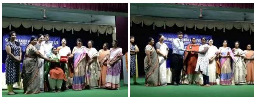
Distributed Prizes to the winners of the NSS Day competitions.