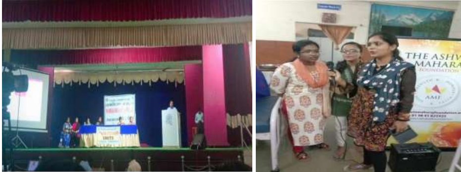
Sarojini Naidu Vanita Maha Vidyalaya has been awarded by ASHWIN MAHARAJA FOUNDATION