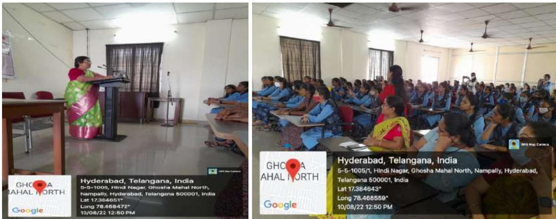
Azadhi ka Amrith Mahostav