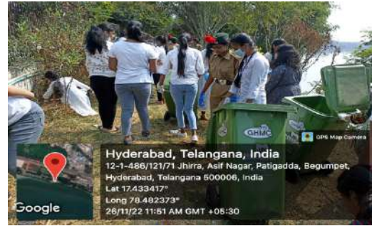
Collection of plastic and handed over to GHMC.