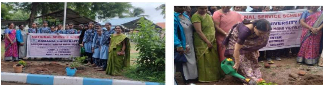
Haritha Haram programme