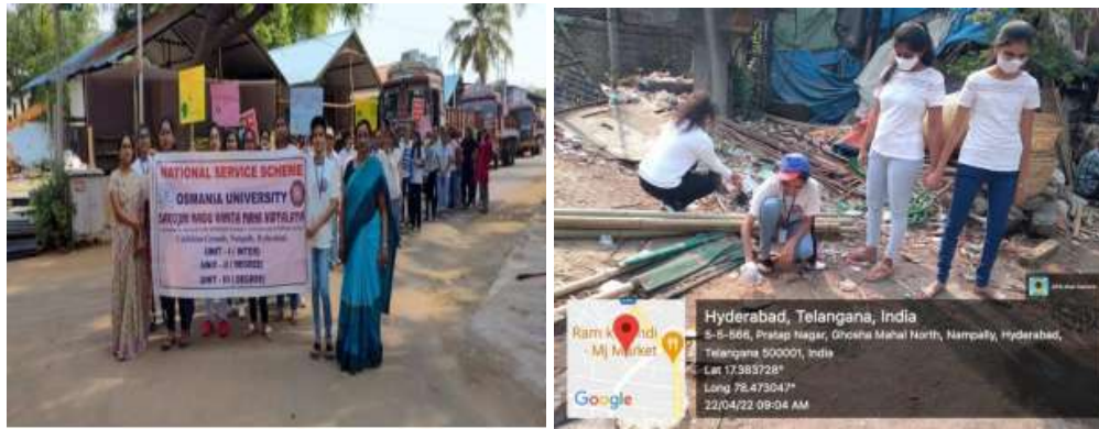
Awareness of Protection of Earth