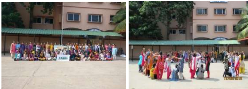
Play for Peace Session