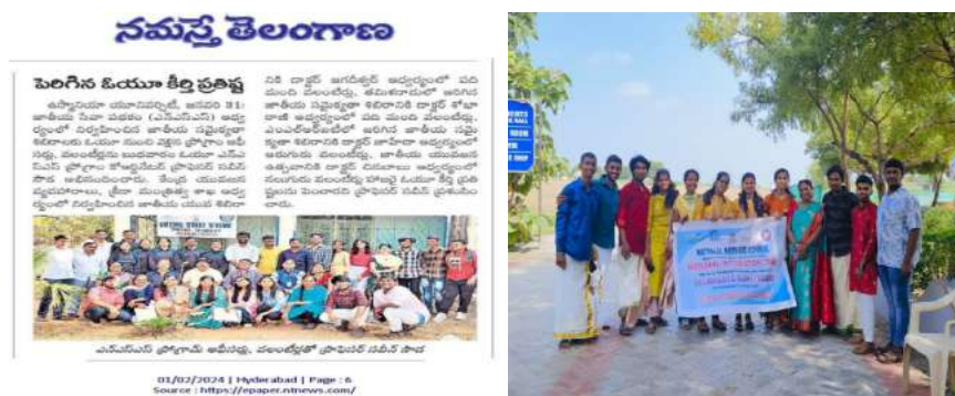
National Integration Camp to Pondicherry