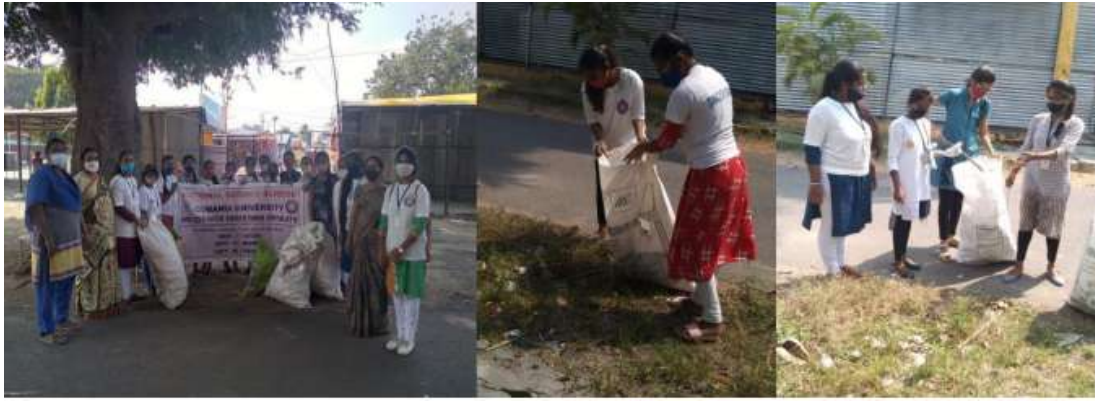
Swachh Bharath program by NSS volunteers