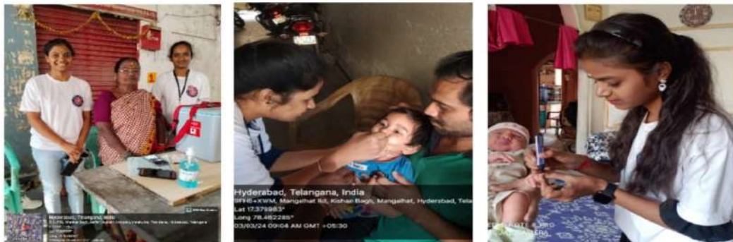
Pulse Polio Immunization Programme