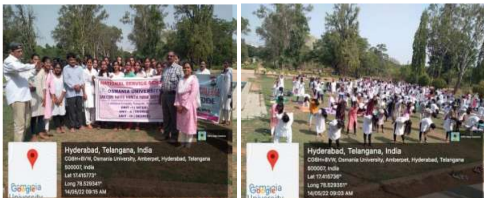
Yoga session at Land Scape garden,OU