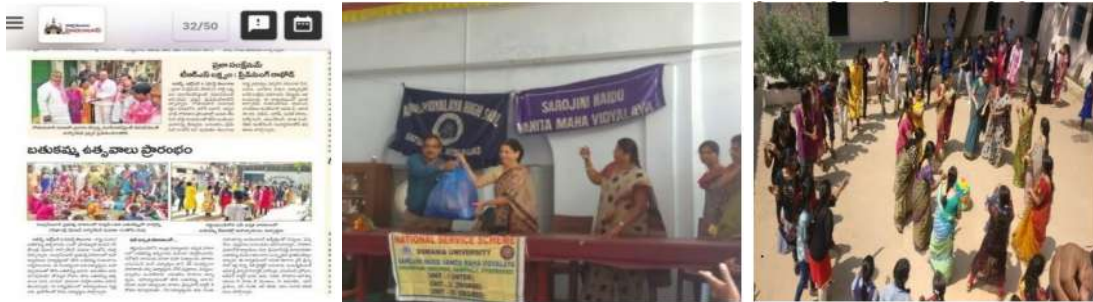
Daan Utsav Celebrations and celebrated Bathukamma