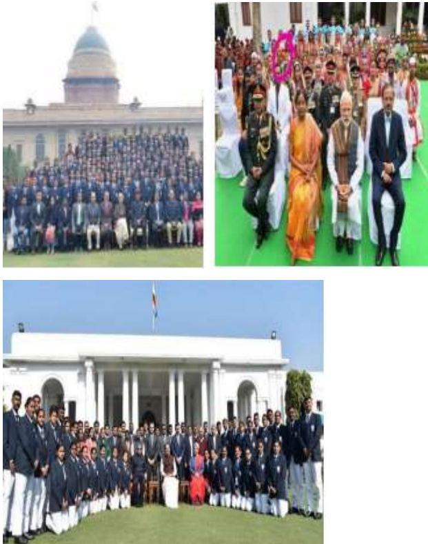
NSS Republic Day Parade Camp