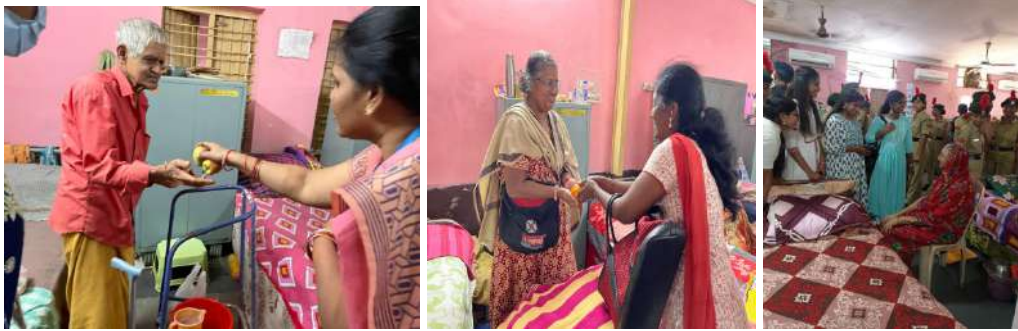
Donated utility items to Jagannath Vrudhashram

09-03-23: CPR training conducted collaboration with St.John Ambulance Association .