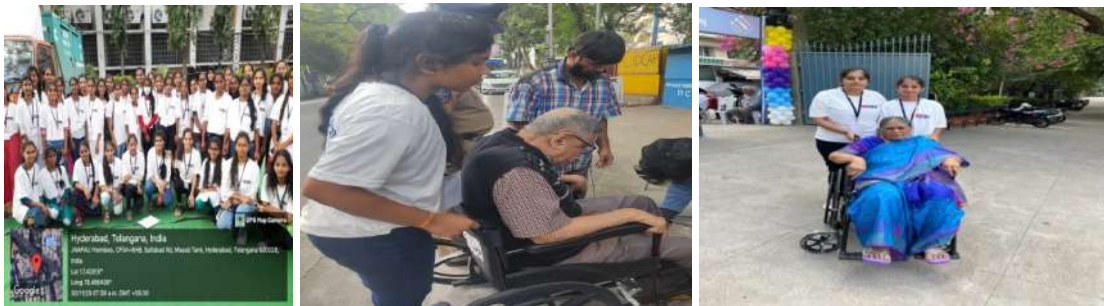
Volunteers assisted senior citizens and physically handicapped