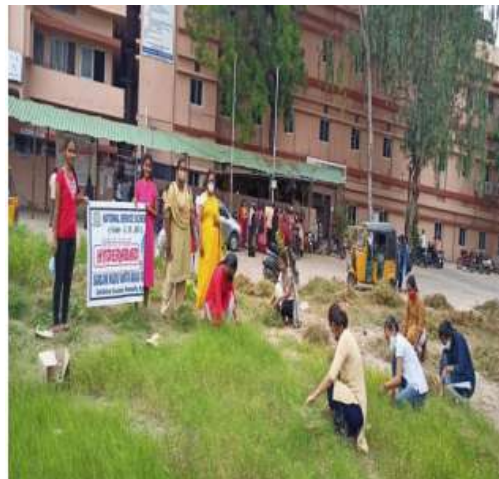
Clean and Green Program