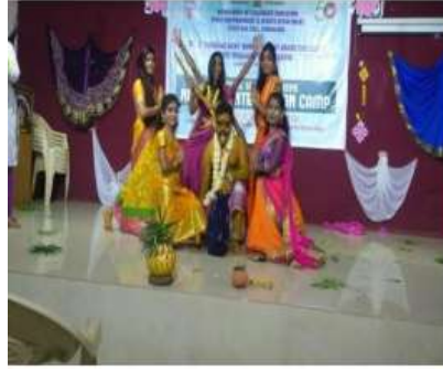
National Integration Camp