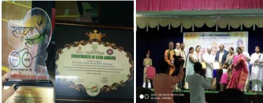
Sarojini Naidu Vanita Maha Vidyalaya has been received Swachhta Hi Seva Award