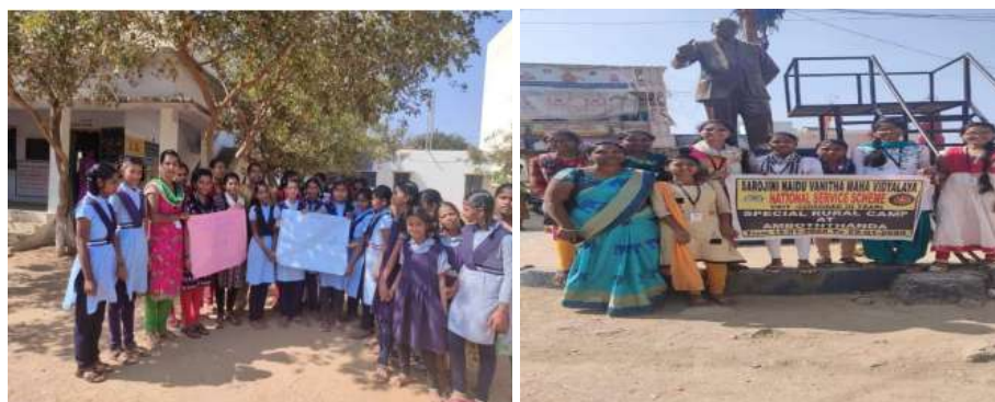
Rural Programme conducted by Swashodan Trust