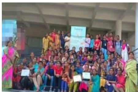
National Workshop on Women Empowerment