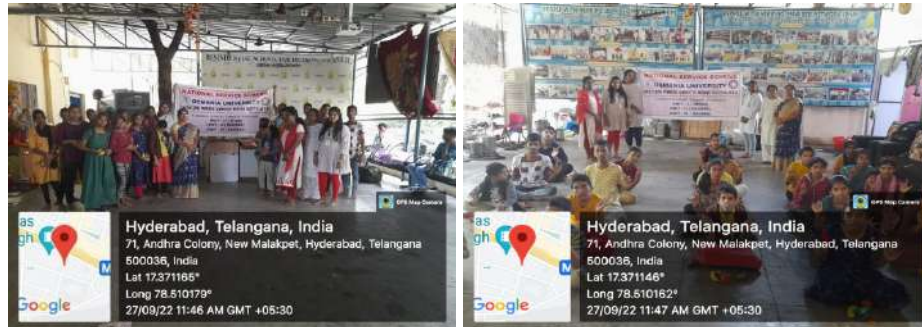
NSS Volunteers distributed fruits, sweets to the children with hearing impaired.