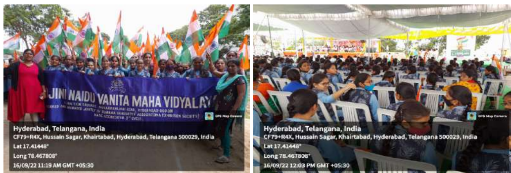
NSS volunteers in liberation day at Hussain sagar