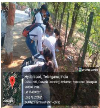
Massive cleaning programme at different places of OU campus