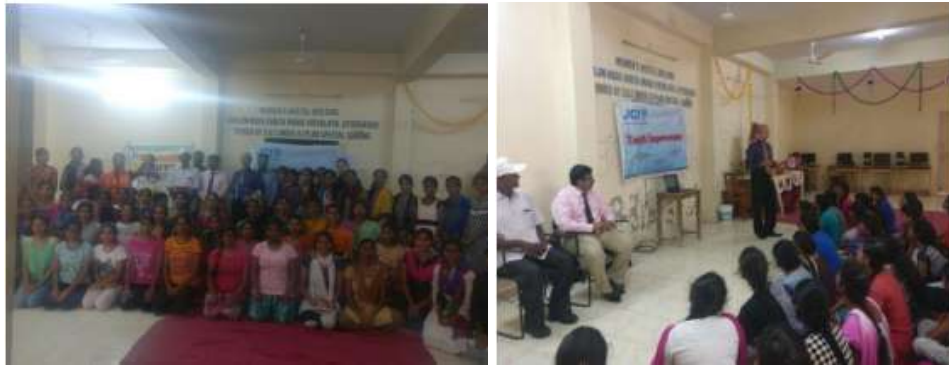
Workshop and a lecture on “How to Boost Brain Memory and Brain Power”