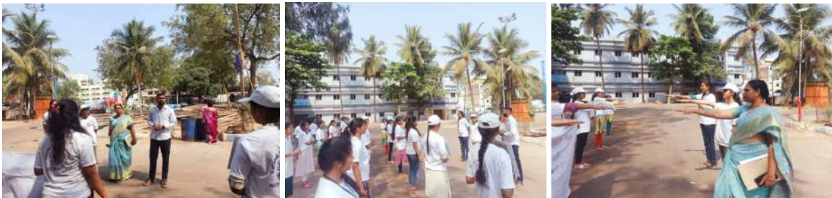
NSS wing with Electoral Literacy club organized Voter Awareness programme