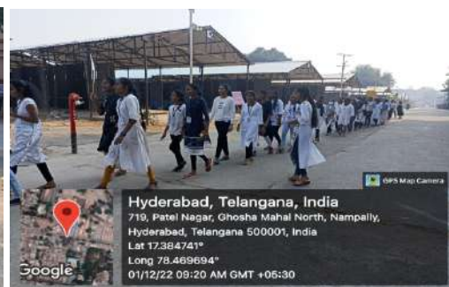
NSS Volunteers participated in AIDS rally