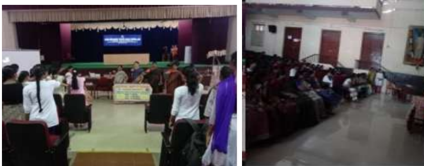
Rastriya Ekta Diwas