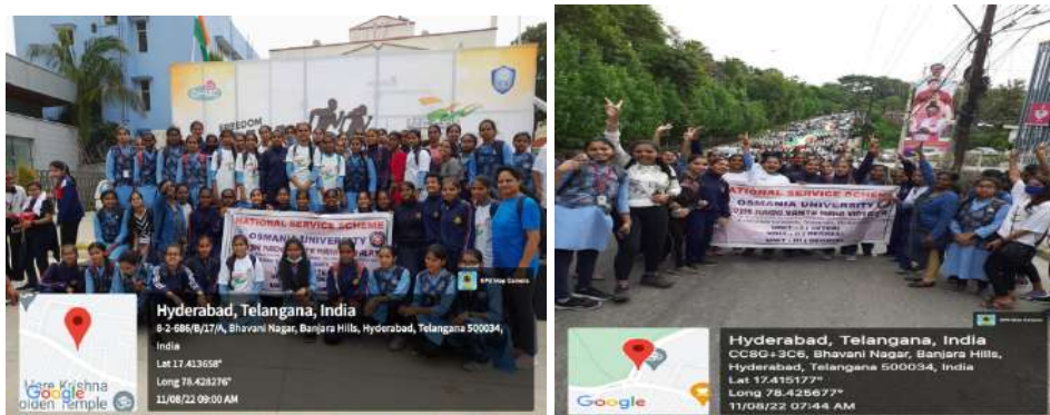
2k & 5k run at necklace road, Hyderabad