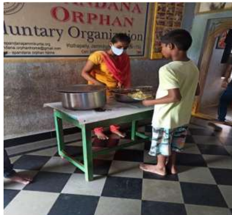
CM Fund Food distribution