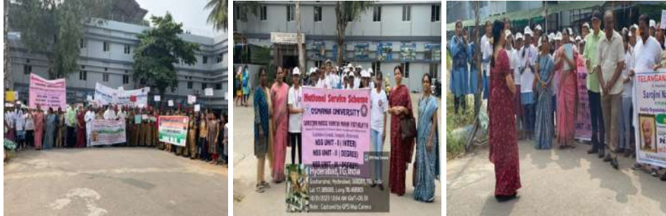
Rastriya Ekta Diwas