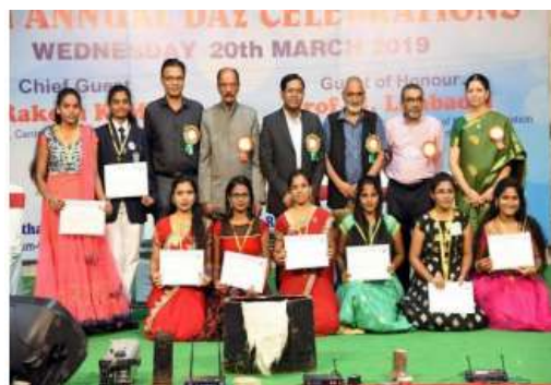
NSS Volunteers were awarded the Gold Medals