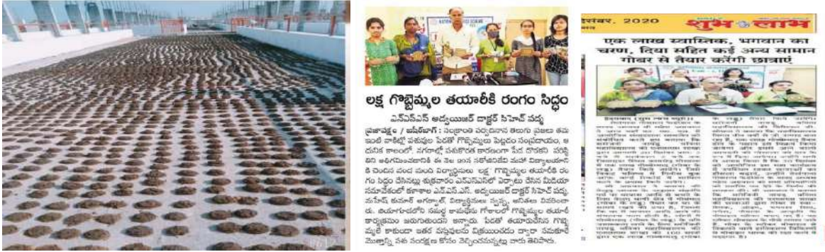
One lakh gobbemalu programme