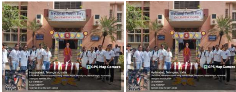
National Youth Day & Birth anniversary of Swami Vivekananda