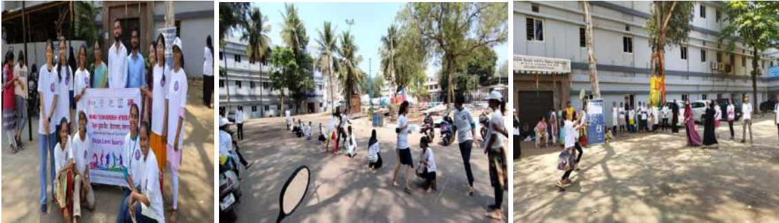
NSS Volunteers participated in Block level Sports Meet