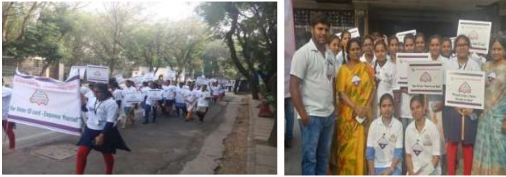
National Voters Day Rally