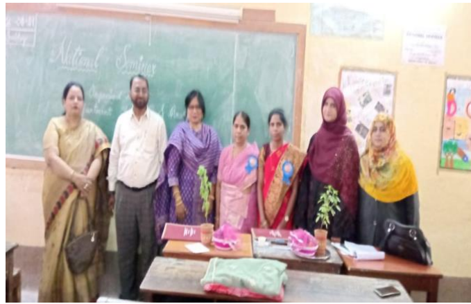
TWO DAY NATIONAL SEMINAR DAY 1