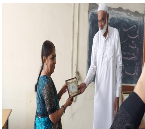
Calligraphy Workshop for Degree Students day 1