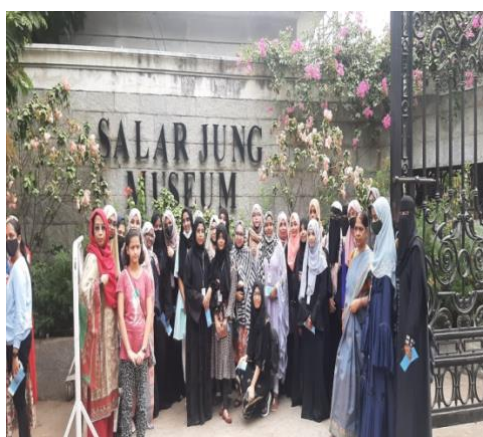
Salarjung Museum filed trip for Degree Students