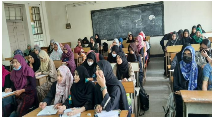
TWO DAY NATIONAL SEMINAR DAY 2