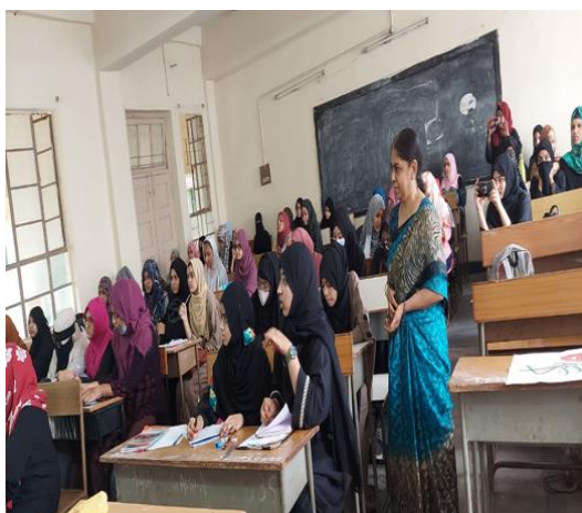
Extension Lecture for Degree students