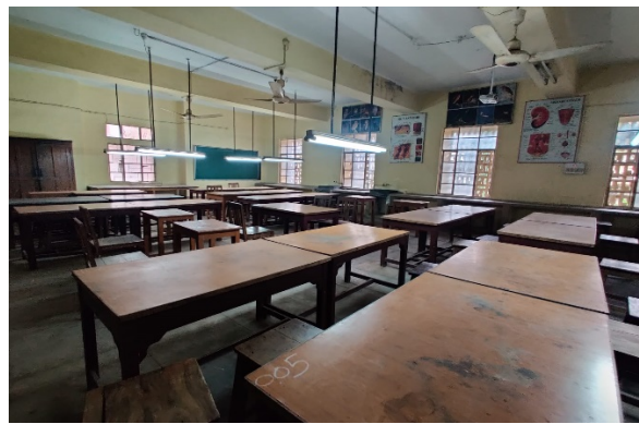
UG LAB 2