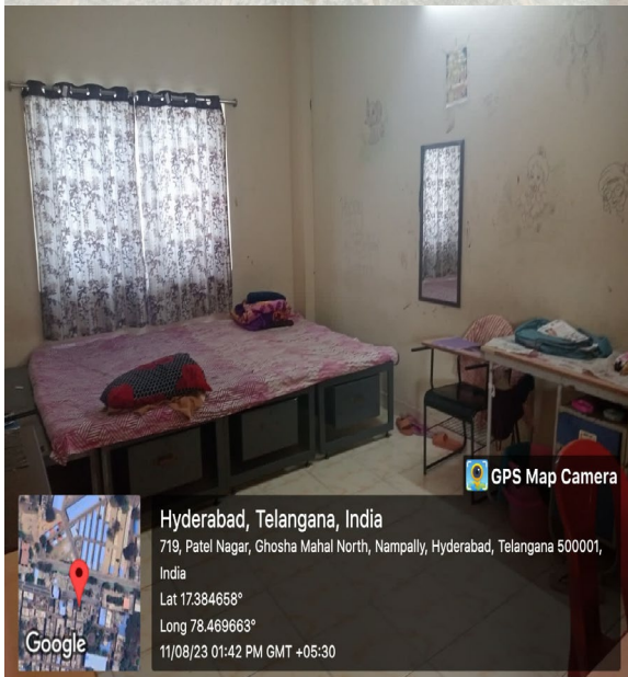
Hyderabad, Telangana, India 719, Patel Nagar, Ghosha Mahal North, Nampally, Hyderabad, Telangana 500001, India Lat 17.384658° Long 78.469663° 11/08/23 01:42 PM GMT +05:30