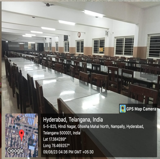
Hyderabad, Telangana, India 5-5-825, Hindi Nagar, Ghosha Mahal North, Nampally, Hyderabad, Telangana 500001, India Lat 17.384289° Long 78.469257° 09/08/23 04:36 PM GMT +05:30