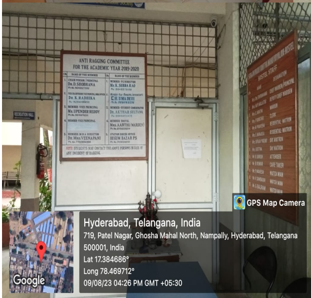
Hyderabad, Telangana, India 719, Patel Nagar, Ghosha Mahal North, Nampally, Hyderabad, Telangana 500001, India Lat 17.384686° Long 78.469712° 09/08/23 04:26 PM GMT +05:30