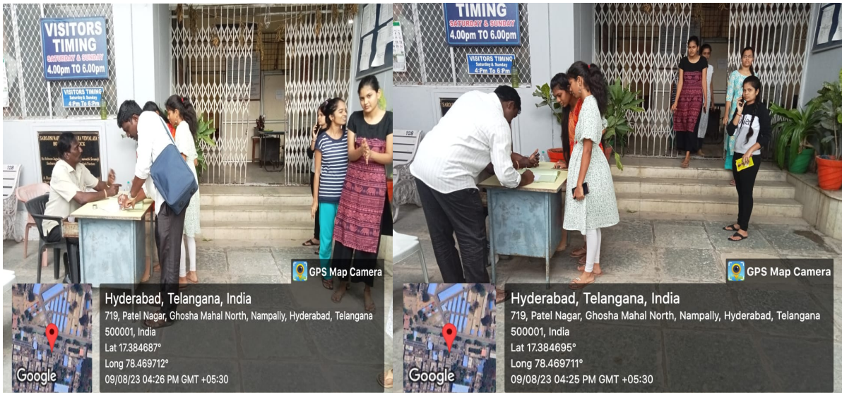
Hyderabad, Telangana, India 719, Patel Nagar, Ghosha Mahal North, Nampally, Hyderabad, Telangana 500001, India Lat 17.384687° Long 78.469712° 09/08/23 04:26 PM GMT +05:30