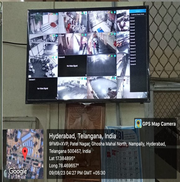
Hyderabad, Telangana, India 9FM9+XVP, Patel Nagar, Ghosha Mahal North, Nampally, Hyderabad, Telangana 500457, India Lat 17.384895° Long 78.469657° 09/08/23 04:27 PM GMT +05:30