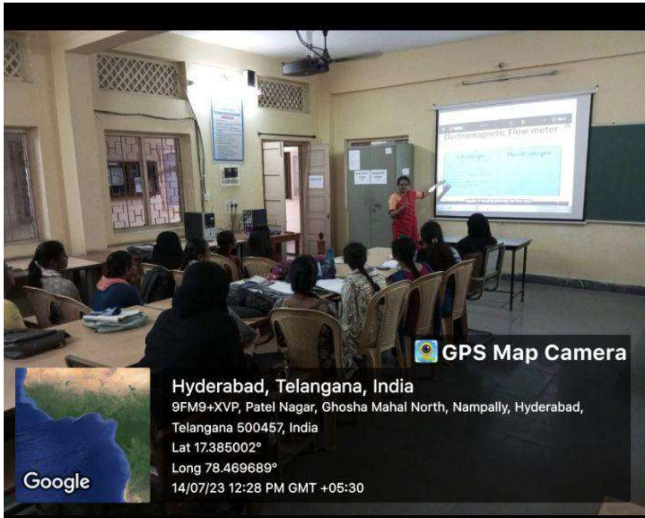
Electronics Lab with ICT facility