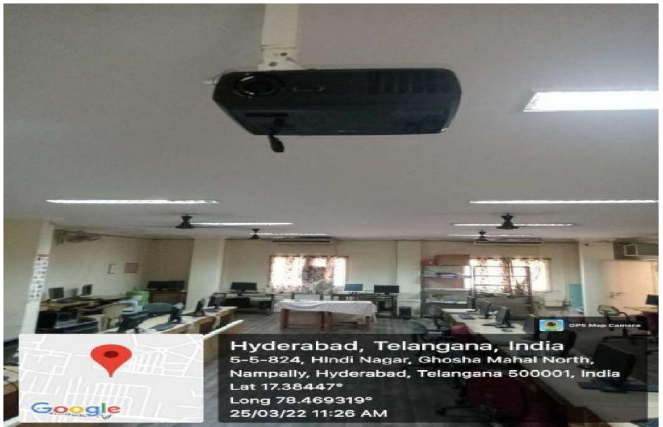
Computer Lab With ICT facility