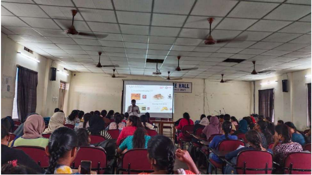
Golden Jubilee hall with ICT facility